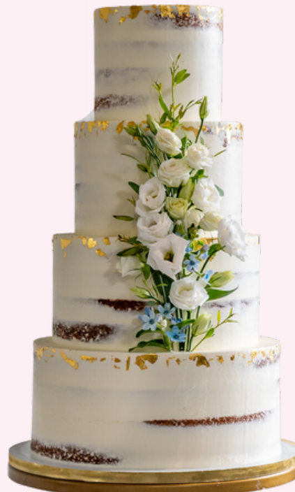
4 tiered cake Feeds up to 125