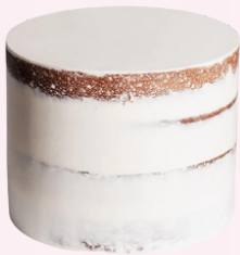
6" cutting cake Feeds up to 14