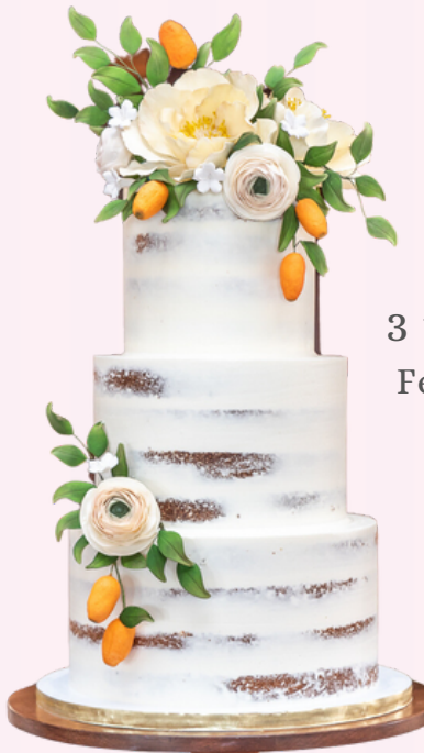
3 tiered cake Feeds up to 75