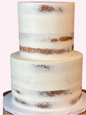
2 tiered cake Feeds up to 38