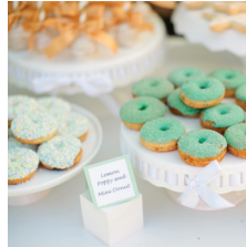
TABLE TOP DONUT WALL